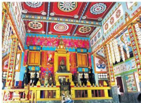
The vihara of Phra That Khiri Khet temple, or Wat Lum, is painted in colourful decorations.