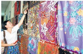
Batik sarongs are offered in an old tailor shop on Si Takua Pa Road.

"Compact and serene" can serve as a short definition of the old town of Takua Pa in Phangnga province, about 100km north of Phuket International Airport.