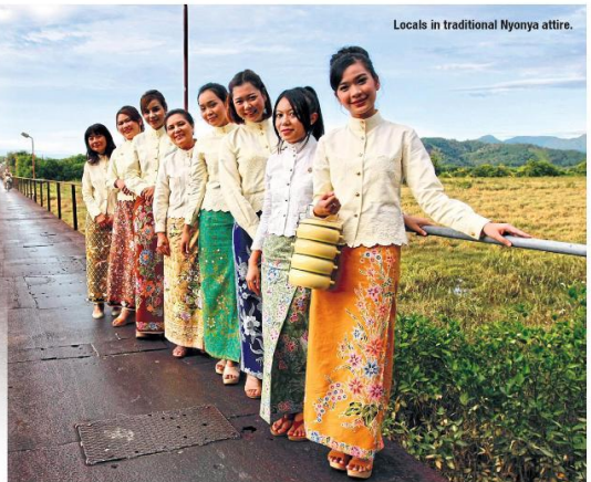
Locals in traditional Nyonya attire.

Si Takua Pa Road is also the venue for a walking street on Sunday afternoons. The market is open from 3pm until 8pm, from the last Sunday of November to the end of May. This year the opening ceremony will be hosted