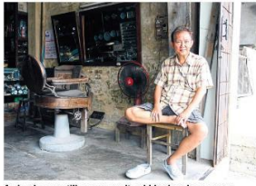
A shophouse still preserves its old barbershop corner, now defunct, for visitors to see.